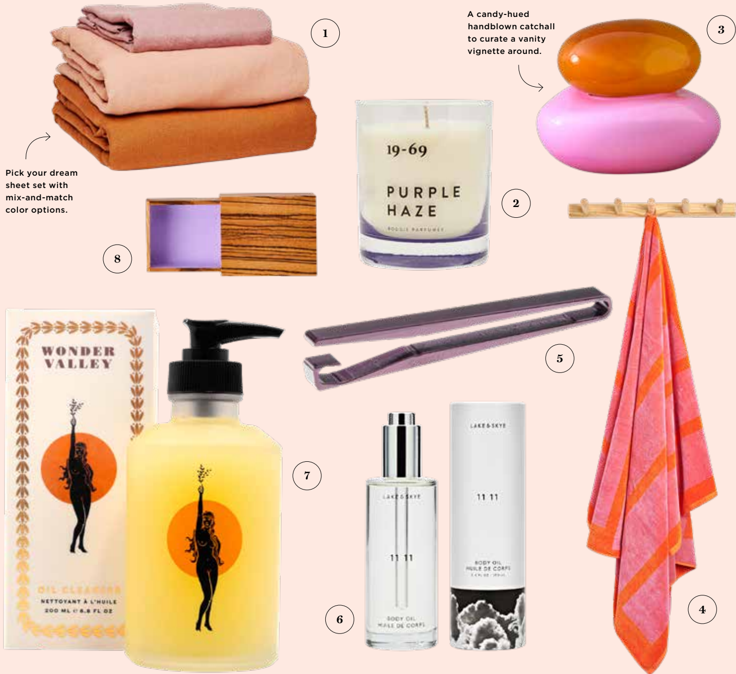
1. Bedding Set from $250 bedthreads.com 2. Purple Haze Candle $70 nineteen-sixtynine.com 3. Bonbonniere Glass Dish with Lid $398 hellemardahl.com 4. Stack Towel $195 lateralobjects.com 5. Hantani Tweezers simian.co.jp 6. 11 11 Body Oil $48 lakeandskye.com 7. Oil Cleanser $65 welcometowondervalley.com 8. Wood Matchbox by Glaze $65 food52.com

The fragrant body oil, plush patterned robe, and other necessary indulgences to channel the ultimate stay-in spa.