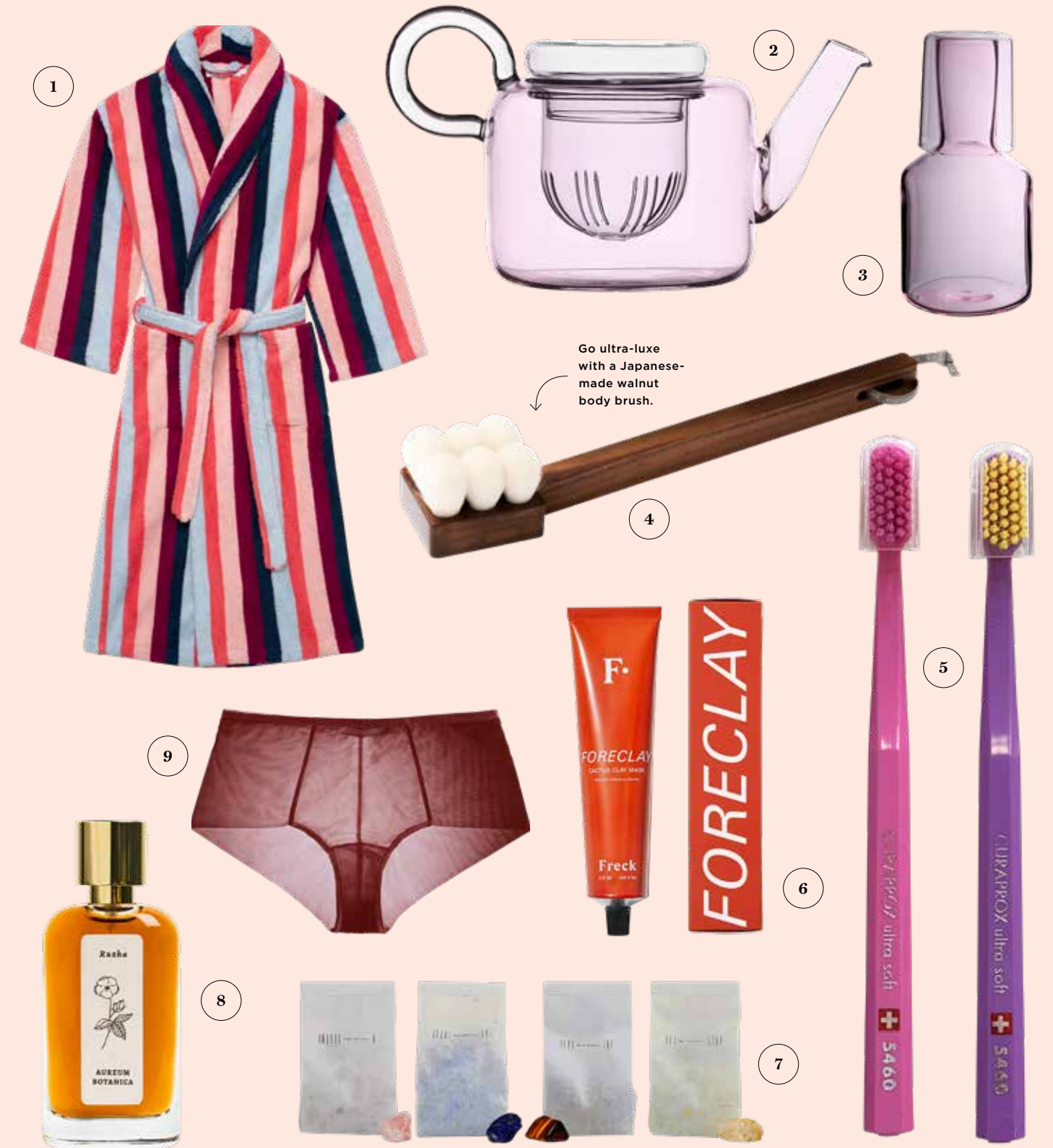
1. Towel Robe $160 desmondanddempsey.com 2. Piuma Teapot by Ichendorf Milano $65 newformsdesign.com 3. Carafe and Glass $79 maisonbalzac.com 4. Suvé Body Brush by Shaqda $210 net-a-porter.com 5. Toothbrush by Curapox $9 schoenstaub.com 6. Foreclay Cactus Clay Mask $22 freckbeauty.com 7. Bath Brews $25 each hellen.nyc 8. Ruzha Fragrance $165 aureumbotanica.com 9. Canova High-Waist Bikini Briefs $50 thegreateros.com