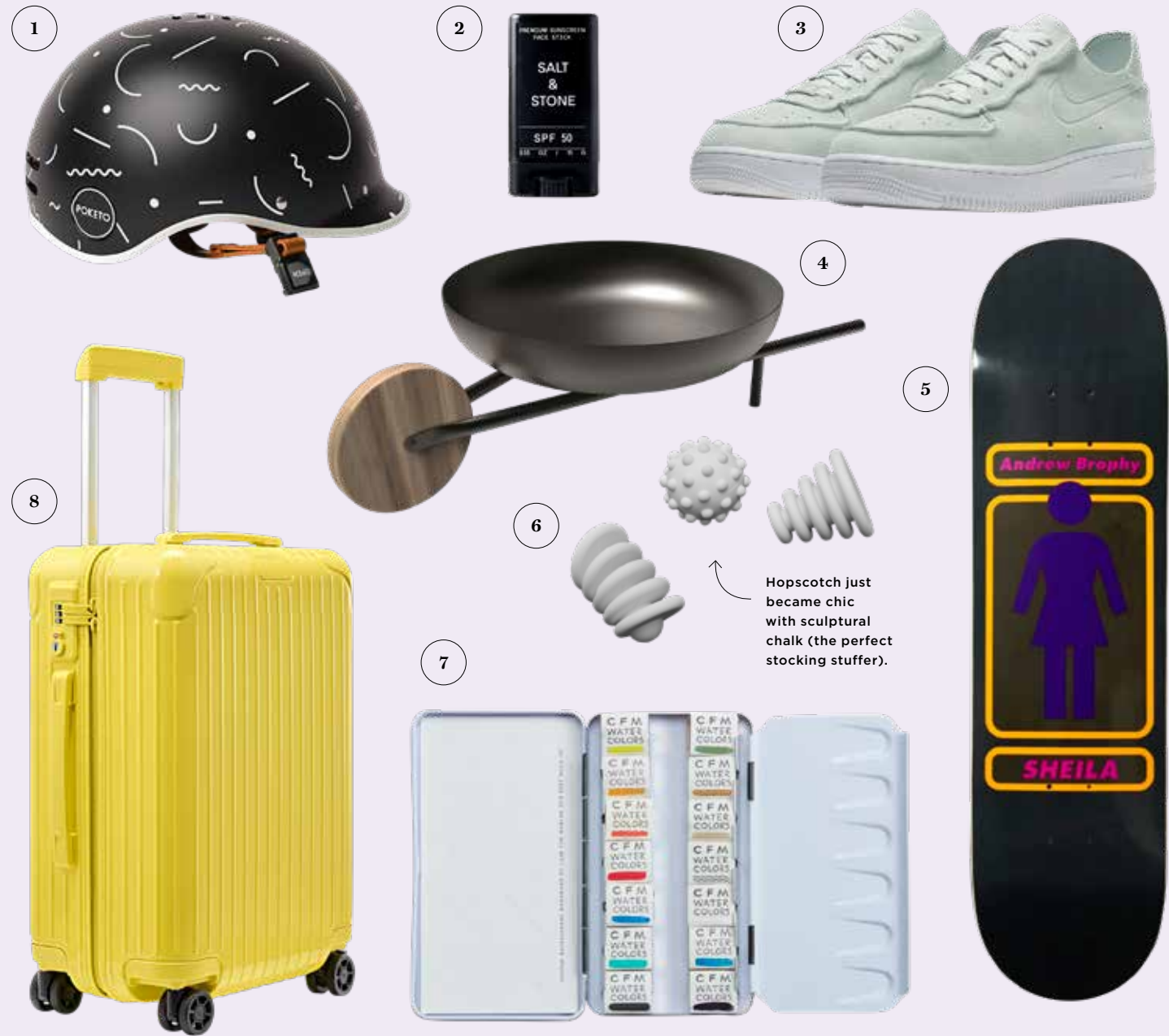
Hopscotch just became chic with sculptural chalk (the perfect stocking stuffer).

Stylish all-weather gear, a zippy suitcase, that top-of-the-line camera—and more items for an adventurous New Year.