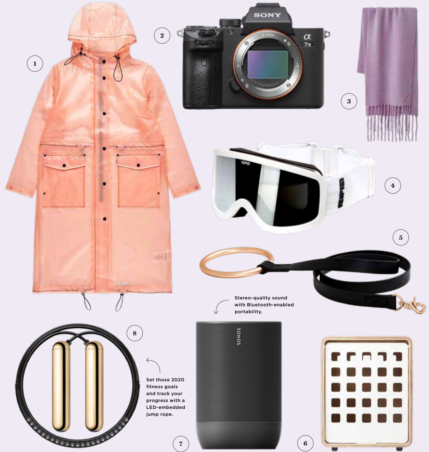
Stereo-quality sound with Bluetooth-enabled portability.